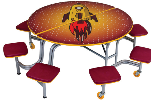
Deluxe Stool Top and Bottom with Two Colors

Table top shall be supported by heavy-duty 14 gauge, 3" wide formed channel hexagon shaped steel frame reinforced with metal gussets for extra strength and maximize table top support.