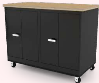
Double Door/Double Door