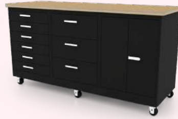
6 Drawer / 3 Drawer / Double Door