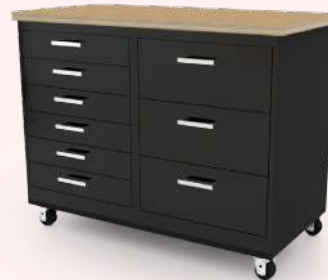
6 Drawer/3 Drawer