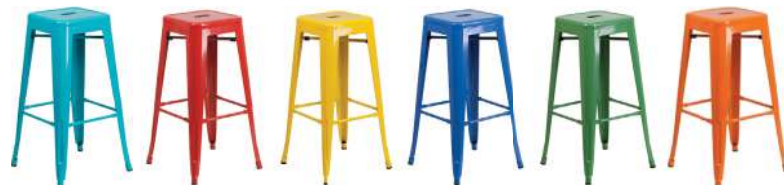
Teal Blue Red Yellow Royal Blue Green Orange