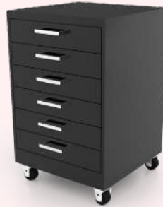
6 Locking Drawers