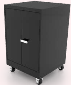
Padlockable Double Doors w/ Shelf