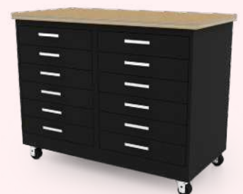
6 Drawer/6 Drawer