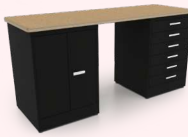
Double Door / 6 Drawer