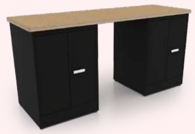
Double Door / Double Door