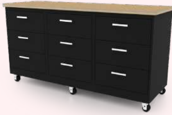
3 Drawer / 3 Drawer / 3 Drawer

3 POD CONFIGURATIONS (Shown w/ 74x25 Shop Top) - (72" W x 24" D)