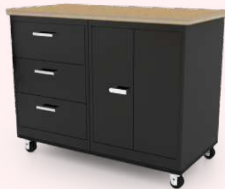
3 Drawer/Double Door