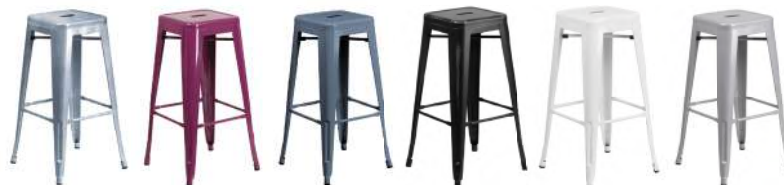
Raw Steel Purple Storm Cloud Black White Silver