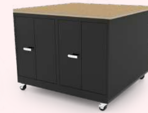
Double Door / Double Door / Double Door / Double Door