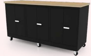
Double Door / Double Door / Double Door

4 POD CONFIGURATIONS (Shown w/ 49x49 Shop Top) - (48" W x 48" D)