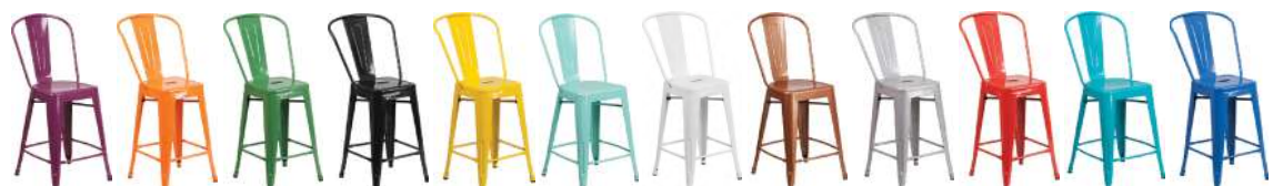
Purple Orange Green Black Yellow Mint Green White Copper Silver Red Teal Blue Royal Blue