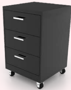
3 Locking Drawers