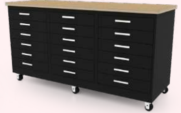
6 Drawer / 6 Drawer / 6 Drawer