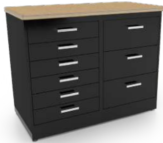
Glides (Elevated Base)