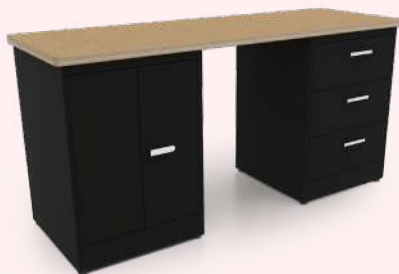
Double Door / 3 Drawer

DESK POD CONFIGURATIONS (Shown w/ 74x25 Shop Top) - (72" W x 24" D)