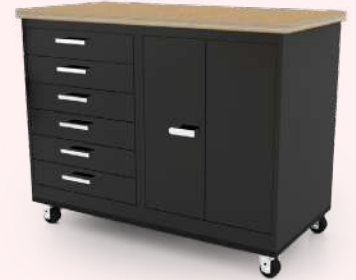
6 Drawer/Double Door