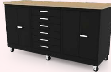
Double Door / 6 Drawer / Double Door