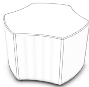
24" Diameter (DIA)