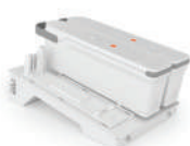
Table Top Charger