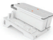
Table Top Charger