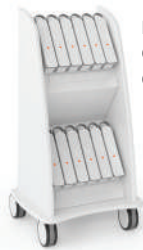
Mobile Charging Cart