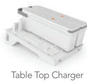
Table Top Charger