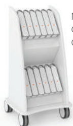
Mobile Charging Cart