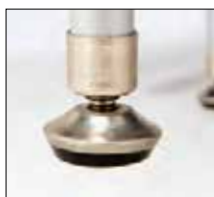
Self-Leveling Glide For all surfaces. Automatically adjusts.