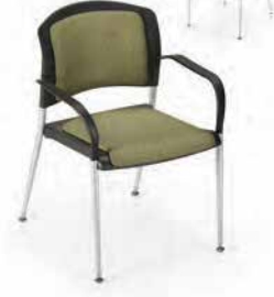
SG1K Stackable Guest Chair

SPECIFICATIONS Overall width 25" Overall height 33.75" Back 20"w x 15.25"h Seat 19"w x 20"d Seat height 18" Warranty 7 year limited