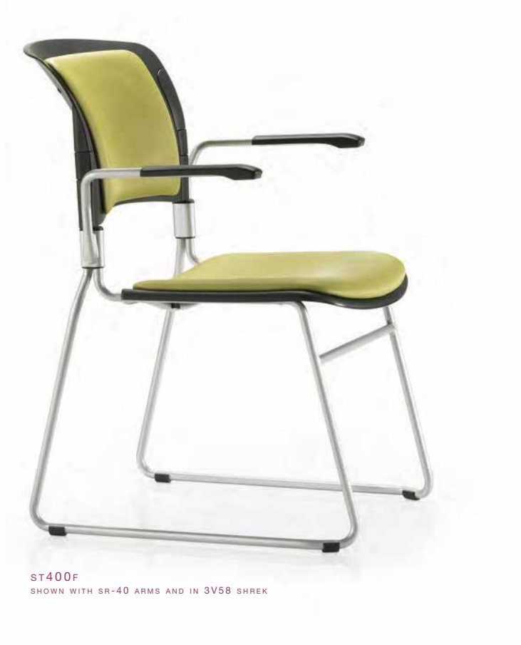
ST400F SHOWN WITH SR-40 ARMS AND IN 3V58 SHREK