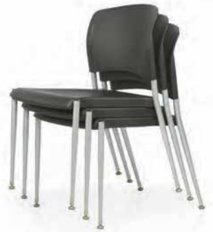
SG300 STACKS UP TO 5 HIGH ON FLOOR