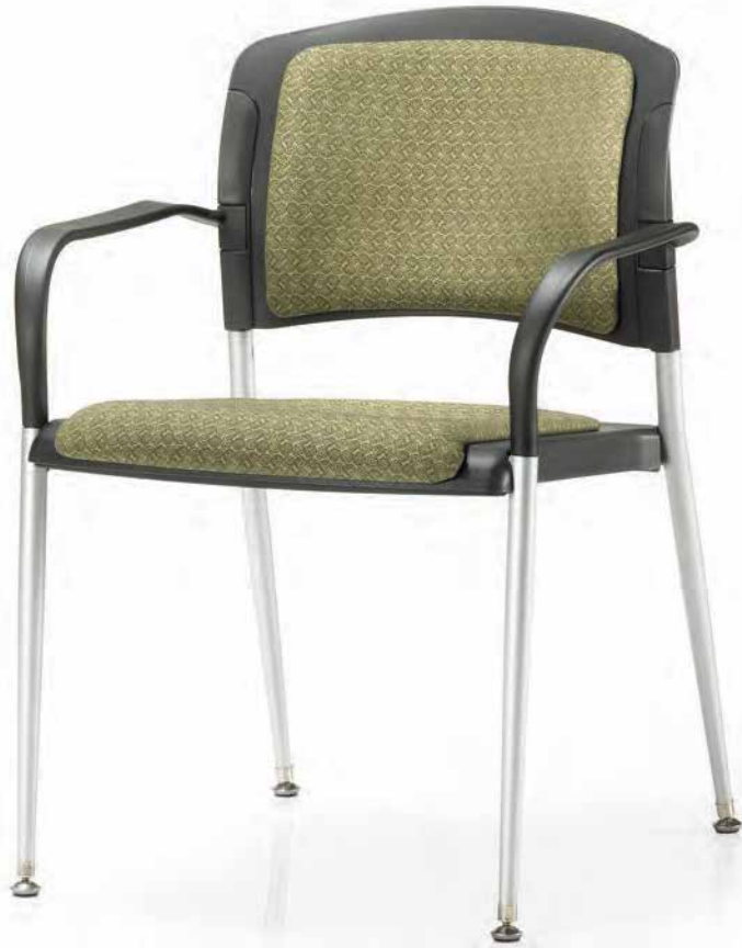
SG3B SHOWN IN 3318 CACTUS