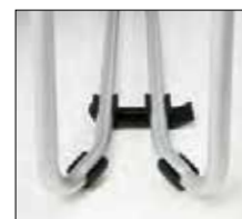
ST-GANG Option for all ST chairs. One pair gangs two chairs.