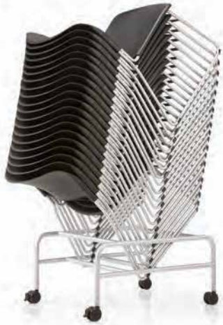
ST400 STACKS UP TO 30 HIGH ON STDLY4 DOLLY