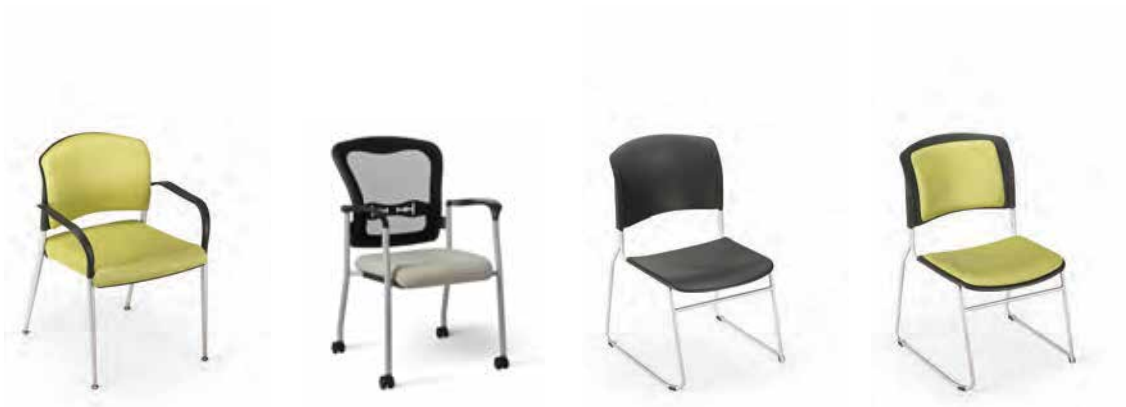
SG3W Stackable Guest Chair