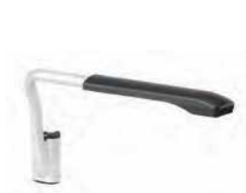
SR-40 For ST400 and ST400F chairs. Increases overall width of chairs to 24".