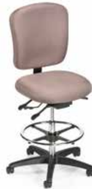
IU55 Intensive Use Stool

Pneumatic lift EZ back height adjustment Independent seat and back angle adjustment Sliding seat Fabric panel back