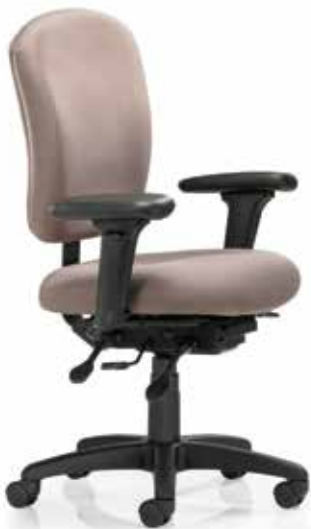
IU54 WITH JR-59 ARMS