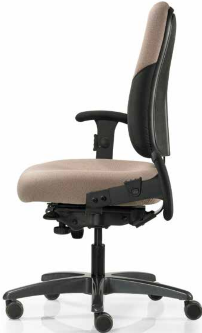
IU76PD SHOWN WITH JR-BN ARMS