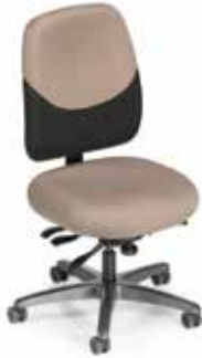
IU76PD Heavy-duty Task Chair