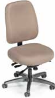
IU76HD Heavy-duty Task Chair