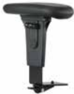
KR-540 Extra wide arm pads Maximum mobility arm top

Optional 8" cylinder available (seat height 21-29")