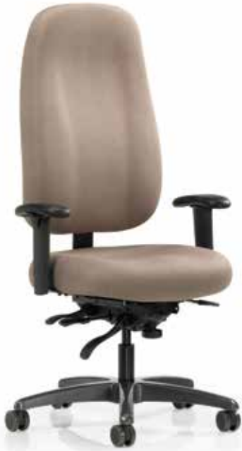
IU79HD SHOWN WITH JR-77 ARMS