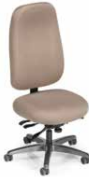
IU79HD Heavy-duty Management Chair