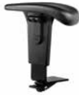
KR-200 Contoured arm pads Height and width adjustable