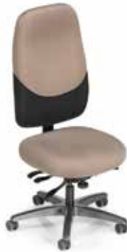
IU79PD Heavy-duty Management Chair