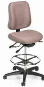
IU73 Intensive Use Stool

Pneumatic lift EZ back height adjustment Independent seat and back angle adjustment Sliding seat