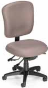
IU54 Intensive Use Task Chair