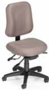
IU72 Intensive Use Task Chair