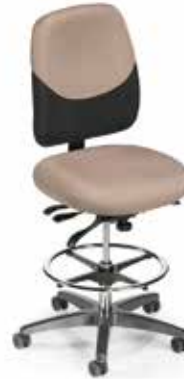
IU77PD Heavy-duty Management Chair