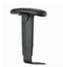
JR-77 Molded arm pads Height adjustable

Optional 8" cylinder available (seat height 21-29")