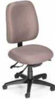
IU76 Intensive Use Management Chair

Pneumatic lift EZ back height adjustment Independent seat and back angle adjustment Sliding seat