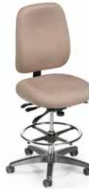
IU77HD Heavy-duty Stool