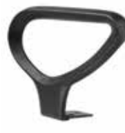
KR-48 Loop arms Fixed position