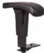
KR-300 Contoured arm pads Tall height and width adjustable