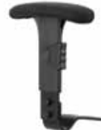
JR-BN Ballistic nylon arm pads Height adjustable with fold-back feature